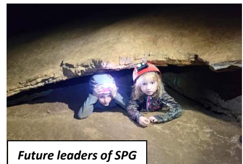
Future leaders of SPG