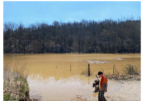
Parking area with flood water on MCKC property at Kieseewetter Cave