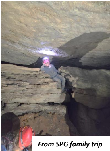
From SPG family trip

look around. The girls had a great time and were even pointing to things! Everyone had a great time and would definitely be interested in revisiting the cave.