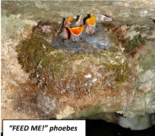
"FEED ME!" phoebes