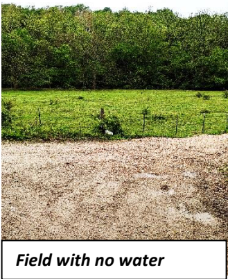
Field with no water

Lake Ozarks Grotto (LOG). Kieseewetter Cave. Ken Long reported that the key had been broken off in the lock for the 2 nd time but the group replaced it. Ken had a picture of the parking area for the cave during the Gasconade River flood, taken on March 25 th . Goodwin. Ken Long, Klaus Leidenfrost and Jean Knoll worked at the sinkhole on April 29 th . They replaced the gate that had been damaged by thieves who stole almost everything on the site. The old safety fence was taken down, vegetation removed and a new fence put in place. An old lawnmower was fixed so that they could mow the grass. The fate of this sinkhole project is unknown at this time. On Apr. 28 th , we were saddened by the loss of another LOG member, Craig Smith, who passed away from a fast-moving brain cancer.—Alberta Zumwalt