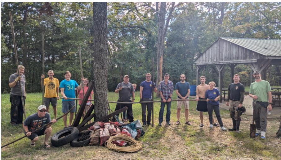
MSS cooperators who showed up in support of MCKC's efforts to clean up Pleasant Valley Cave.