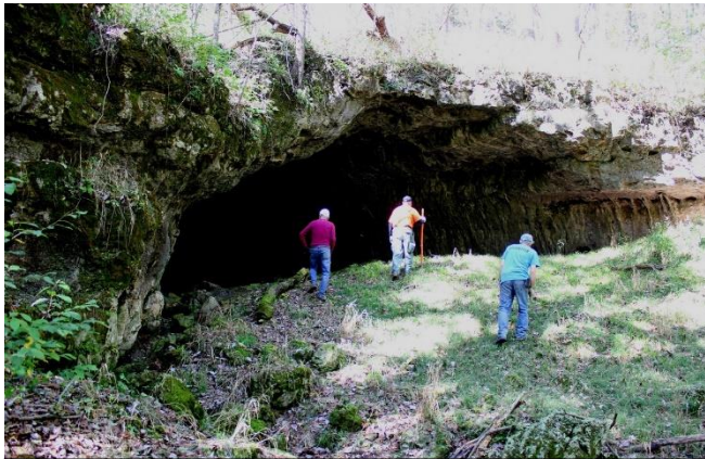
Let’s protect this Gray Bat Maternity Cave!