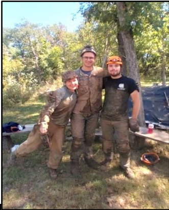
MST students from Rolla