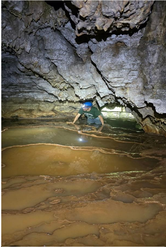
High, wet passage in Massey Cave