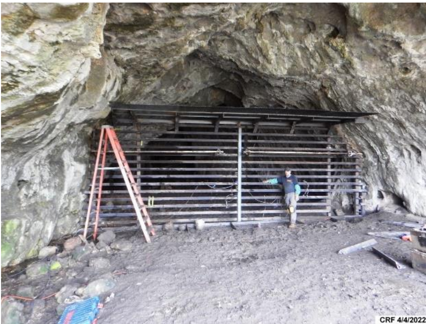
Joe Williams in front of nearly completed Toby Cave fly-over gate

much closer to the power pole, between the fire ring and the sky crapper. After trying several possibilities using a transit, they selected the best location and staked out the location for the eight posts that will support the roof. The 24 X 20-foot area was angled relative to north to provide the flattest area to build on. The cedar trees planted last year by Rita Worden will someday provide a nice windbreak. They then met with the contractor who will grade the spot and haul in and spread river gravel for a base for the concrete pad. As soon as the post holes are drilled, Rick will let him know and he will get started. Rita Worden arrived shortly after Rick's team did, to work on the trees she put out last year, locating several more of the oak trees previously planted. She flagged them and placed tiles on the ground to help locate them. The newly installed fence will protect them from the longhorns. Mar 19: Bill Gee led a trip consisting of Seth Colston, Martin Carmichael, Kohl Mitchell, Shannon Zaloz and Emma Buckingham to the Mountain Room to relocate the bat roost detector back to the Lunch Room guano piles. They had also planned to do a firmware update, but were thwarted when they discovered they had the wrong cables. They did upload the data and get the detector relocated. Mar 19: Hou Zhong led seven novices on an Introduction to Caving novice trip to Perkins Cave.