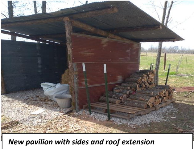
New pavilion with sides and roof extension

Lake Ozarks Grotto (LOG). Apr. 10 th – Goodwin work trip. Ken Long joined Klaus Leidenfrost and Jean Knoll with the plan to finish putting up some tin sheets on the new pavilion that was built last fall. It was too