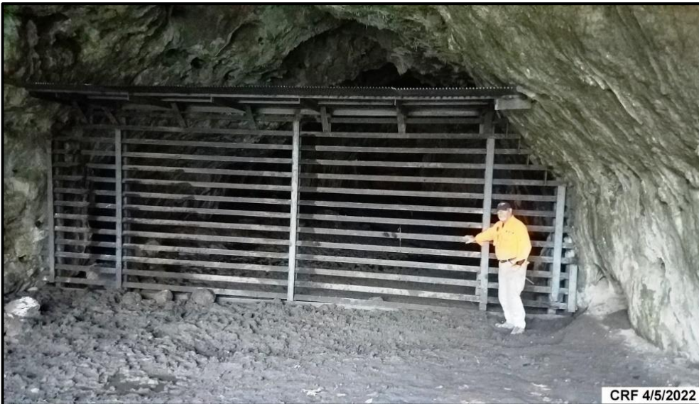
Our maternity colony survey project

Grotto. Flippen Cave was gated by KCAAG and other caver organizations in 2010. Then we moved on to the gray bat cave, which was gated by Cave Research Foundation (CRF) for the U.S. Fish and Wildlife Service and Missouri Department of Conservation (MDC) in April, 2022. There our adventure was immediately complicated by the fact that wood rats had consumed ALL the perishable survey