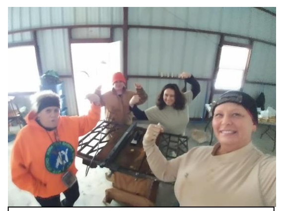
"We can DO it!" – Girl Power in action at Big Caverns Ranch

Schroeder for five hours of biological inventory and map QC check in 2,248-foot-long Fogey Cave. Most of this cave is low stream passage, where recent heavy rains had elevated the stream and created an ear dunk that had to be negotiated. Over 100 feet of unsurveyed passage was discovered in the back of this cave, sending the mapping effort back to the drawing board – or to the sketch pad, as the case may be. Again this year, only a very few tricolored bats were counted in any of the Cloud 9 caves, as opposed to hundreds seen a couple of years ago. Every cave visited had at least a few bats with obvious WNS infection. No other bat species besides tricolored were seen. Feb. 15 th- 18 th - Mark Jones led a President's Day CRF Mammoth Cave Expedition, with Pic Walenta (KCAG) and Krista Bartel (MSM) serving as camp managers. The expedition hosted 54 project cavers, 17 of whom were from Missouri. Walenta and Bartel fed